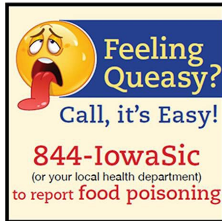
Figure 4: Iowa Food Protection Task Force's – "Feeling Queasy? – Call It's Easy!" campaign

on the business type) within the review period. Award winners vary from food trucks to specific chain restaurant locations, to large chain grocery stores, and even a government building snack bar.