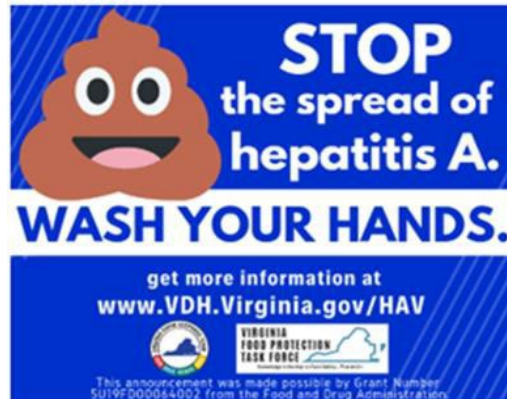
Figure 2: Virginia Department of Health Hepatitis A media image

One story describes the partnership between the Virginia Food Protection Task Force, the Virginia Department of Health, and the Virginia RRT with Pandora Radio to develop a Hepatitis A Pandora Radio Campaign. The “Audio Everywhere” product reached the target audience by weaving the recorded audio advertisement seamlessly into the listening experience between songs and podcasts. The Mobile Display product worked by displaying a media image linked to a webpage when a listener interacts with their device (Figure 2). The team calculated measurable results to gauge the success of the outreach and education campaign.