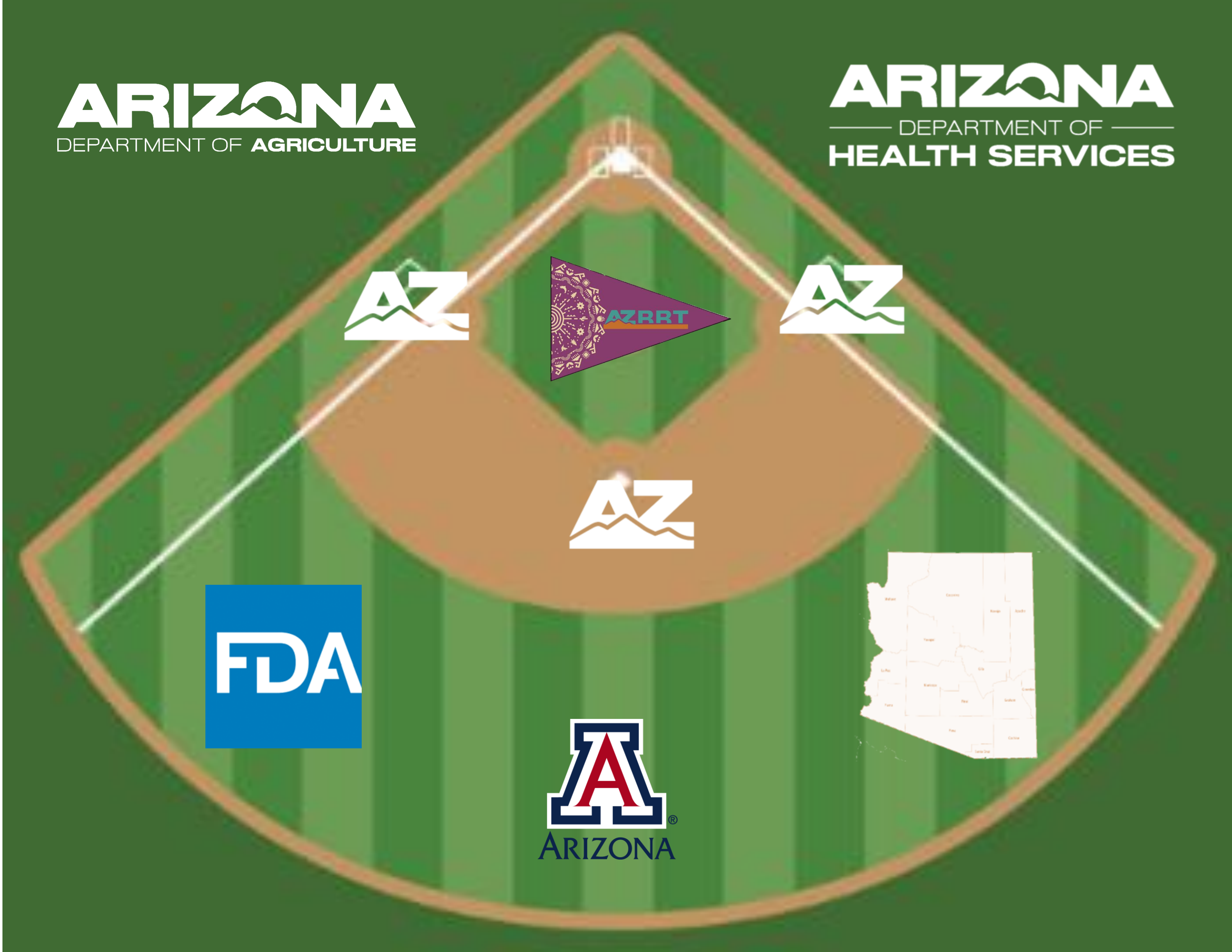
Figure 1. AZRRT Line-up

Pitcher : Arizona Rapid Response Team (AZRRT)