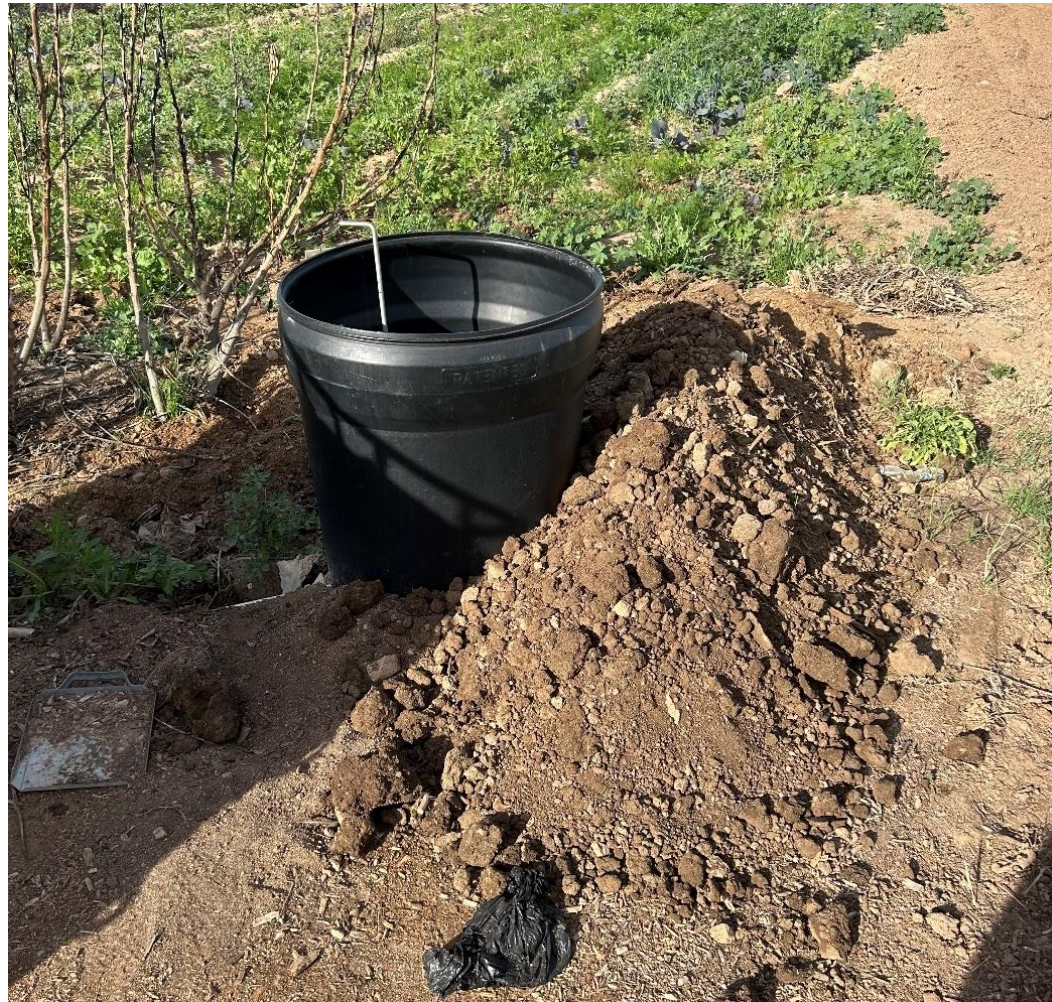
Photo of BSAAO near water barrel.

On 02/24/2024 the AZDA received a complaint about a potential agricultural water contamination at their leased plot within a larger incubator farm. A fellow grower distributed raw chicken manure at the base of the farm’s (and other plots) water barrel(s). Irrigation of crops was continued after noticing the manure. The farmer collected a sample of the chicken manure, sent it to a laboratory; no salmonella or E.coli was detected, but high levels of generic coliform were identified. On 02/26 next steps were discussed along with a sampling plan. The AZDA in partnership with UA conducted independent water quality testing 03/04.