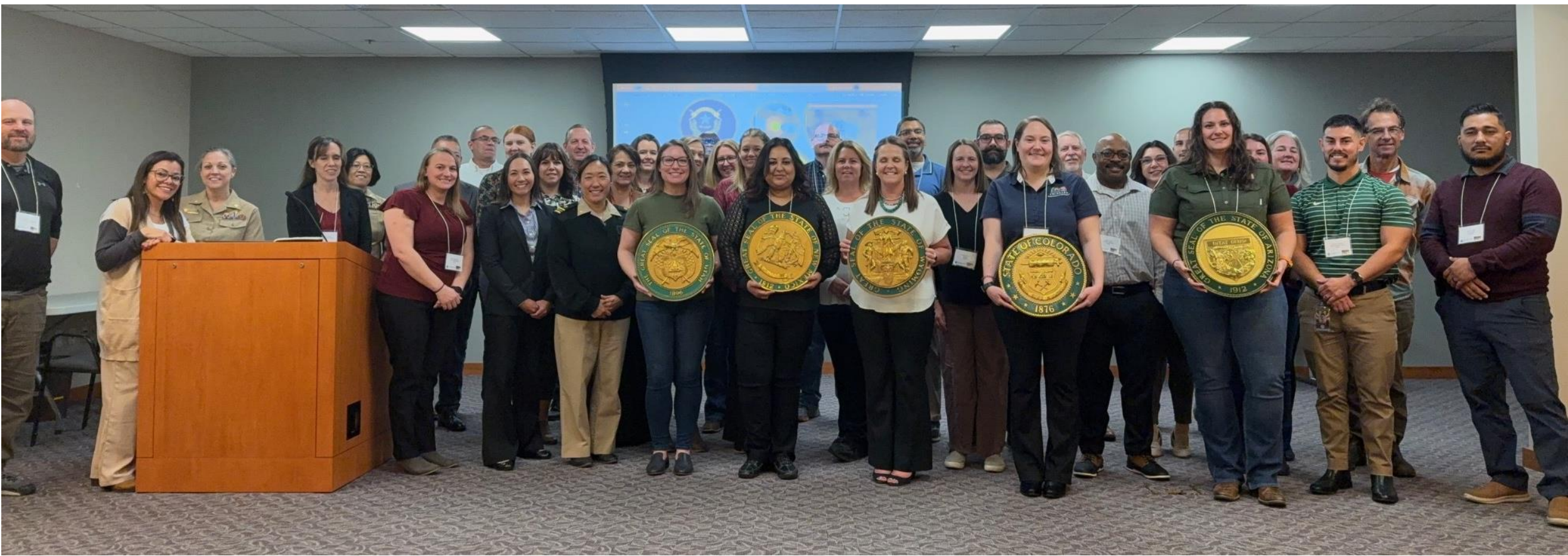
ADHS - EH, Maricopa County EH, and AZDA/AZRRT attended the 6-State Meeting (West 4 regional) in Lakewood, CO Oct 29-30, 2024