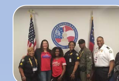
All Hazard Incident Command