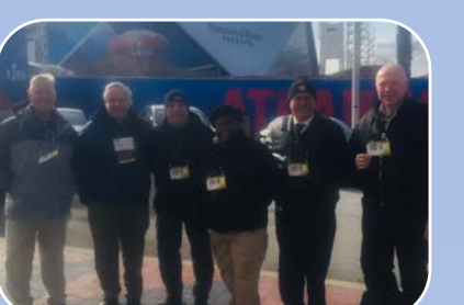
USDA FSIS (IMT Ops at Atlanta Federal Center)