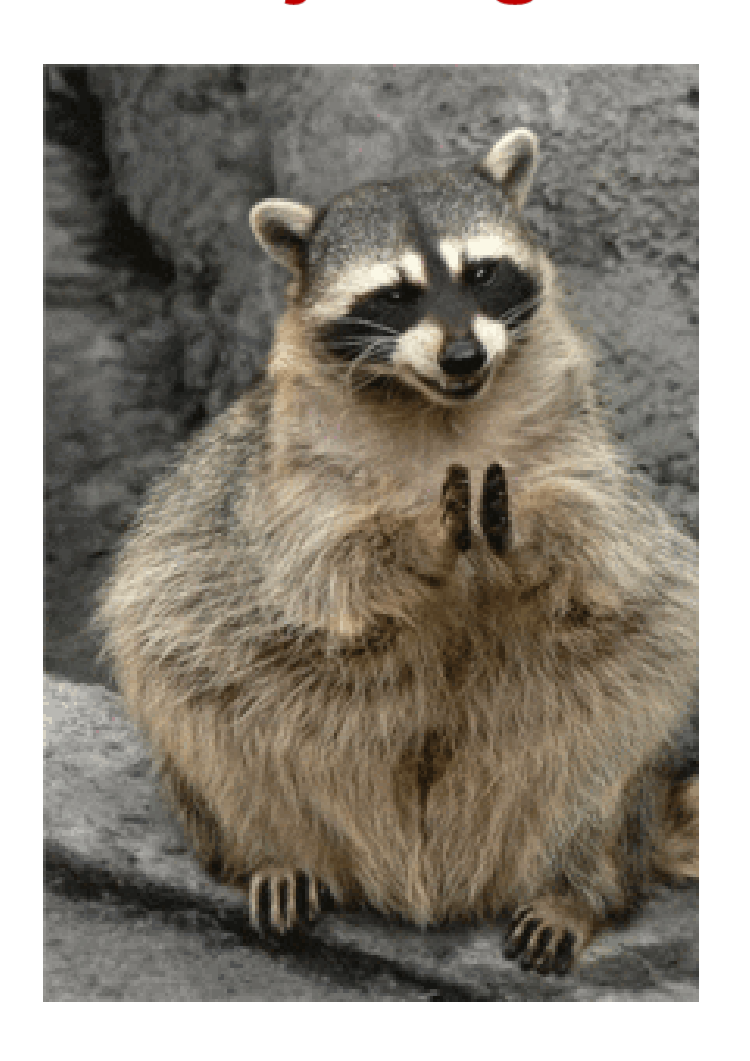
The End – Questions?