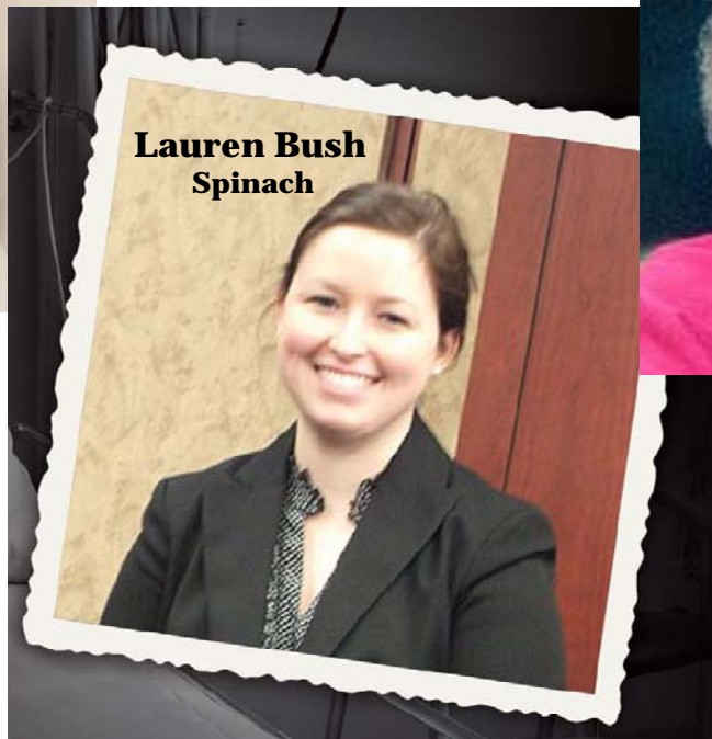
Lauren Bush Spinach