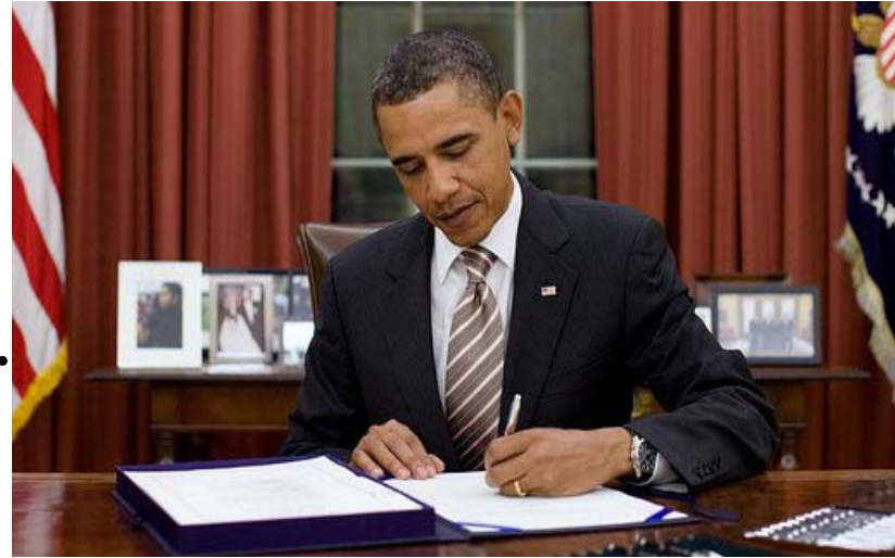
President Obama signs FSMA Jan. 4, 2011

Bold Type Indicates Provisions With State Components